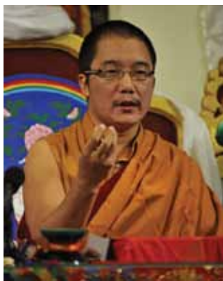
A world-renowned leader is coming to our area. The details are in Tidbits on page 13..