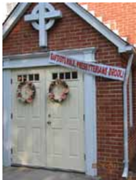
Has war broken out among the churches? Why can't we just get along? See Local News on page 6.