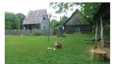
London Town and Gardens in Edgewater, Maryland.