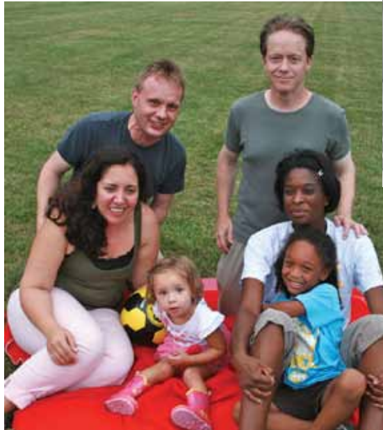
Friends came together for music and soccer games in the park.