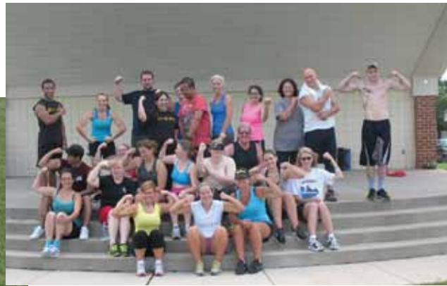
This Sunday morning exercise club invites others to join them at Whalen Commons.