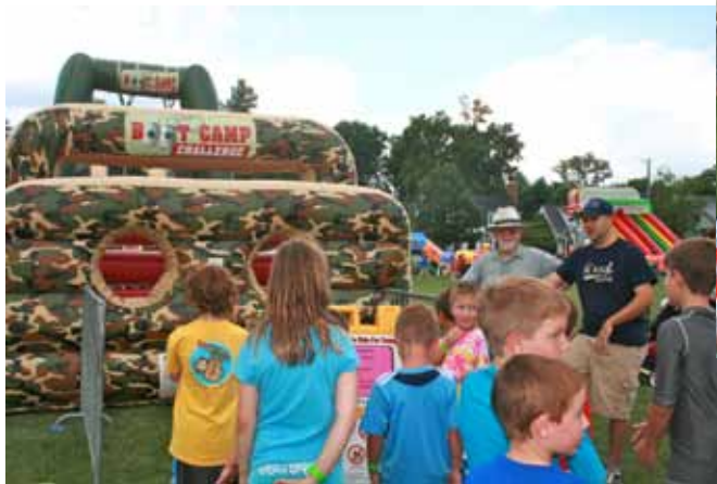
The Boot Camp inflatable challenge proved to be the most popular new attraction at the PES Annual Carnival.