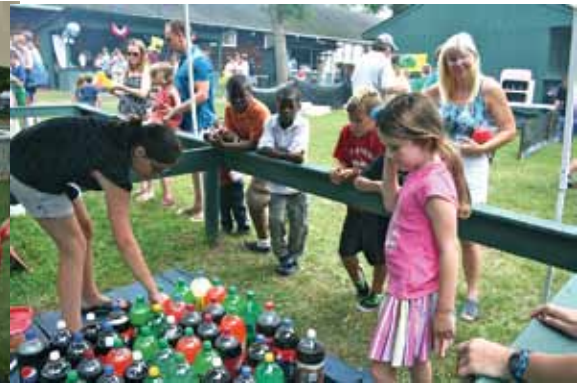
Kids love the ring toss game at St. Mary's annual festival.