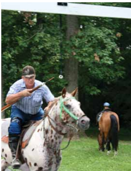
St. Mary's festival form of jousting, Maryland's state sport.