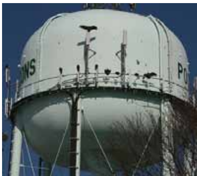
Study finds cell phones on water towers safe for man and vultures. See more on page XX.