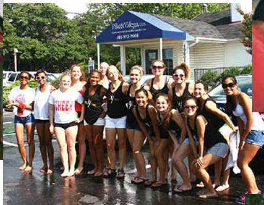
PHS Poms at their annual car wash held at the dental offices of Pike and Valega.