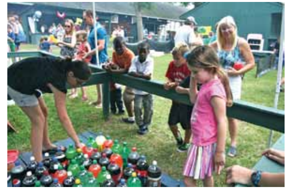
Kids love the ring toss game at St. Mary's annual festival.