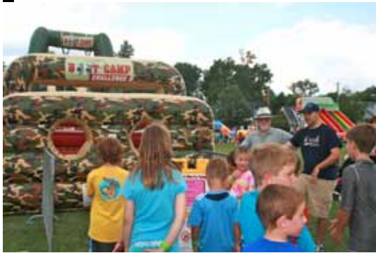
The Boot Camp inflatable challenge proved to be the most popular new attraction at the PES Annual Carnival.