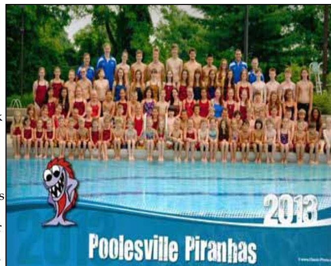
2013 Poolesville Piranhas Swim Club