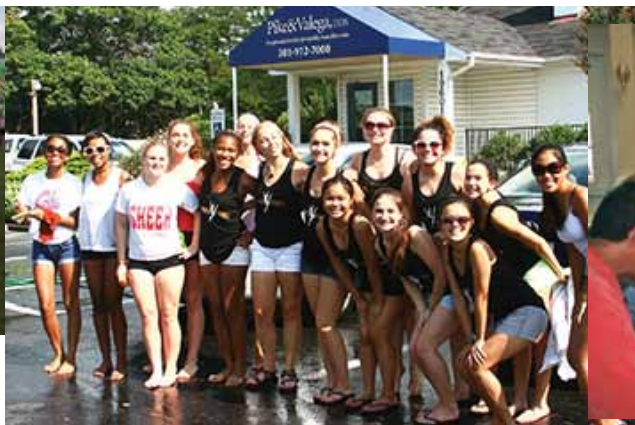
PHS Poms at their annual car wash held at the dental offices of Pike and Valega.